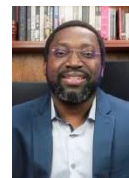
Anicet Okinga National Institute of Industrial Property (INPI)